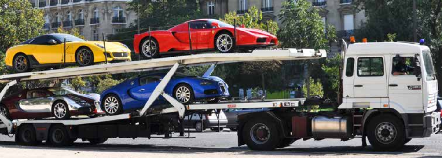
Vice President Obiang's luxury sports cars are seized and towed.

kleptocrat TI should direct attention toward. After Equatorial Guinea failed to make the cut, TI France picked up the campaign, creating videos and other multimedia content to explain Equatorial Guinea's kleptocracy to a French audience.