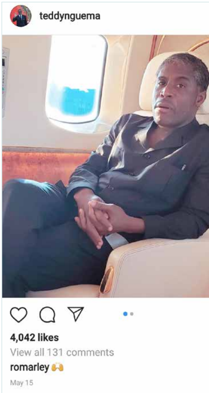
Vice President Obiang often flashes his wealth on his open Instagram feed.

While Vice President Obiang was convicted in late 2017, there are indications that he will not go down without a fight, and that a period of lengthy appeals awaits TI France. 28 In light of this prospect, there have been some missed opportunities for serious advocacy that might enlist regional bodies in the struggle. On January 22, 2018, at its Assembly of Heads of State, the African Union (AU) designated 2018 as the Year of Anti-Corruption in Africa. In a press release issued on the occasion of the launch, AU leaders recognized the corrosive impact of corruption on “promoting democratic governance, socio-economic transformation, peace and security, and the enjoyment of human rights in the AU Member States.” Yet very little in the way of concrete or verifiable results can be identified as having emanated from the AU effort. African civil society was an afterthought in the whole process, with no meaningful space to offer suggestions and drive change.