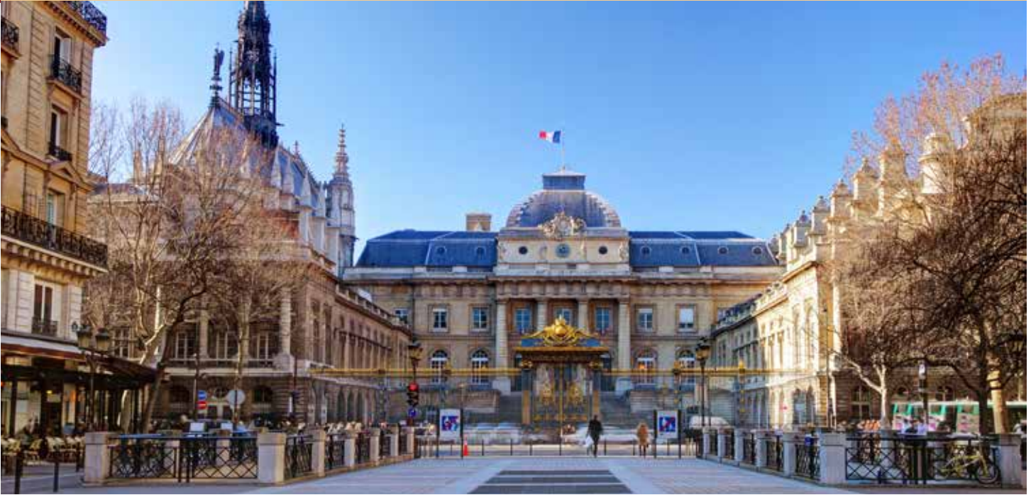
Vice President Obiang was tried and convicted in the Palais de Justice.

The focus of the AU has shifted in 2019—even as corruption remains a severe problem across the continent—but nothing should prevent a broad coalition of African and international civil society organizations from continuing to push AU leaders to take the fight against kleptocracy seriously and advocate for reform, including effective legal remedies.